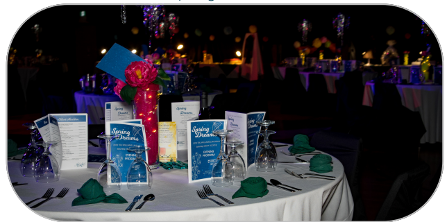
2018 "Spring Dreams" Gala