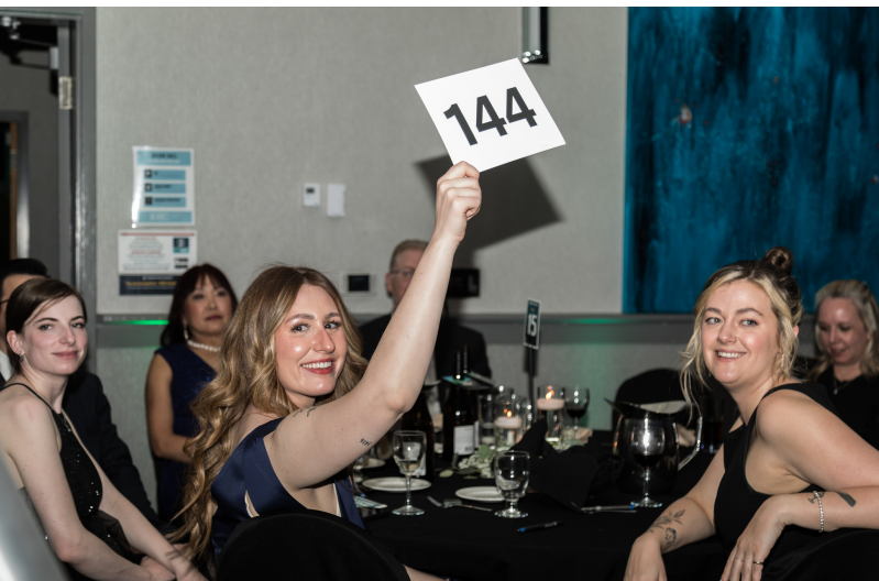
Fund-A-Need Paddle Raise at the 2023 TRU Foundation Gala in Kamloops