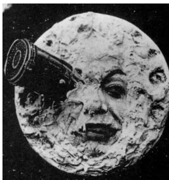
Early cinema adventure in A Trip to the Moon (1902)

This course will compare literary texts and films in the adventure genre to examine questions about medium-specific narrative techniques, and the translations of generic themes across mediums. Within the genre, we would look at fiction and nonfiction writing and film, including bergfilm and memoir. Text pairings would include Krakauer's Into Thin Air and Everest , Around the World in 80 Days , The Revenant , Wild , Push and The Dawn Wall , Careful , The Magic Mountain and German bergfilm of the 1930s. We will examine the translation of literary devices into the visual medium, especially choices in narration, the flashback, and foreshadowing, as well as the translation of metaphor. We will examine faithful and loose adaptations to explore inspiration and allusion and examine how films are valued in relation to each other. This course will involve a short reflective response paper and a major essay comparing and contrasting the adaptations of two film/book pairs in this course.