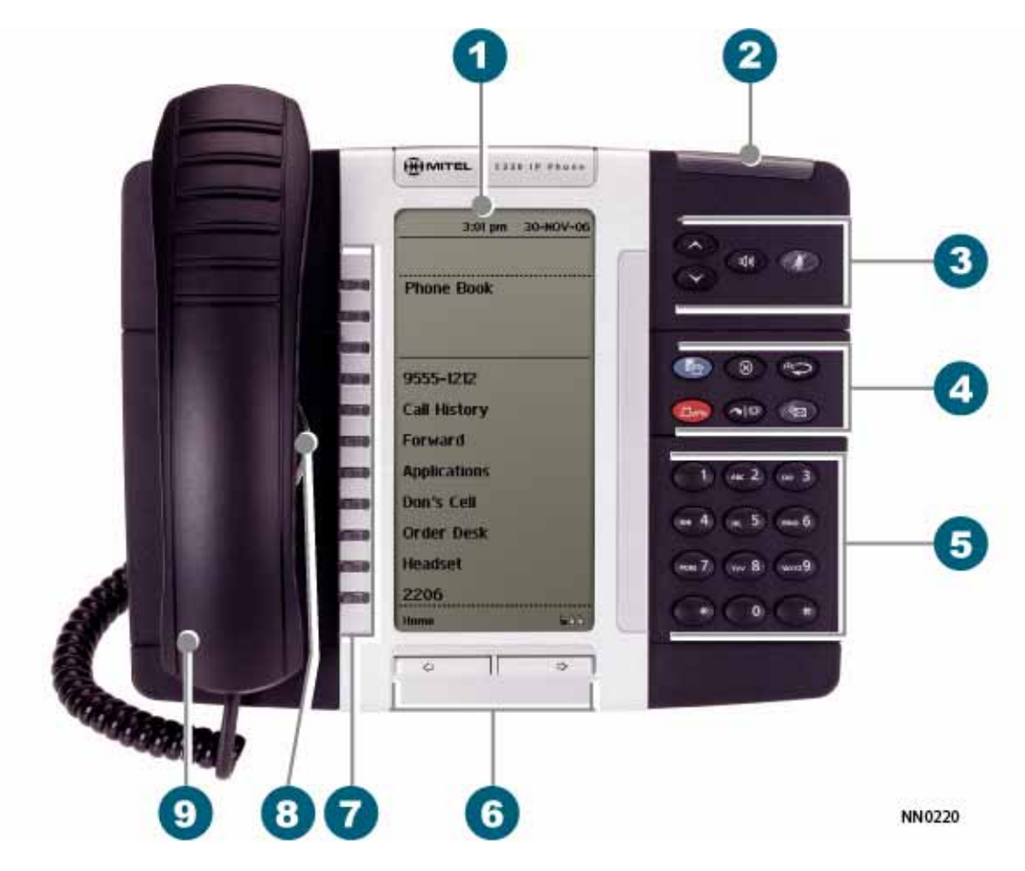
The 5330 IP Phone

The 5330 and 5340 IP Phones support Mitel Call Control (MiNet) protocol and session initiated protocols (SIP). Both phones support the Line Interface Module and 5310 IP Conference Unit. Additionally, they support Hot Desking and Clustered Hot Desking as well as Resiliency. The 5330/5340 phones are ideal for executives and managers, and can be used as an ACD Agent or Supervisor Phone, as well as a Teleworker Phone.