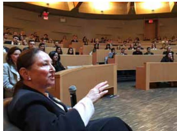
Justice Abella fields questions on equity, women in law and the Supreme Court from a packed theatre of TRU Law students and alumni at the Barber Centre.

TRU signed an agreement of cooperation with Dalian Maple Leaf Educational Systems (MLES) on Nov. 20, which will see 20 MLES graduates annually enrol in the Bachelor of Science program, followed by the Bachelor of Education. BEd grads will have employment opportunities in MLES off-shore BC Education Ministry accredited schools, which teach BC Curriculum.