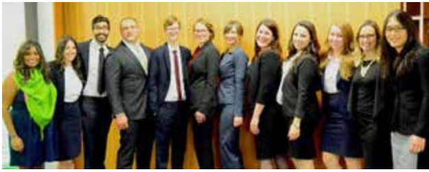
Environmental and Natural Resources Law Club students competed at the UBC Environmental Law Group Negotiation.