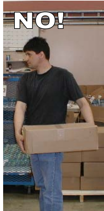
Figure 4 - DO NOT TWIST!