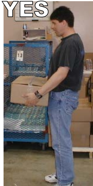
Figure 3 - FACE THE DIRECTION