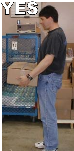
Figure 3 - FACE THE DIRECTION