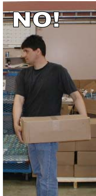
Figure 4 - DO NOT TWIST!