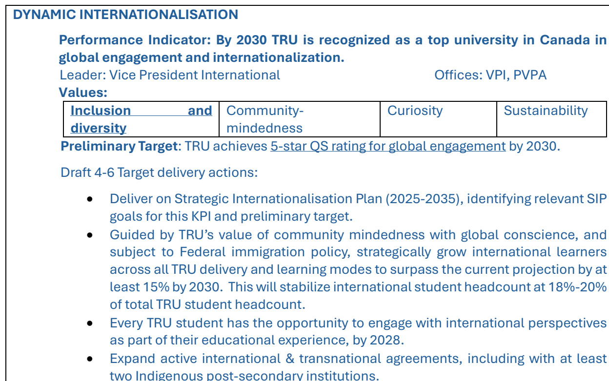
Figure 1: Example of Goal (2025-2030), performance indicator and draft target delivery actions:

To support shared understanding, each goal will be reported on, consistently and regularly. An example of a dashboard reporting format for a fictional goal is provided, below (see Figure 1).