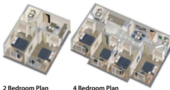
2 Bedroom Plan

The 11-storey TRU Rez has some of the best views in the city. Each of the 570 private bedrooms include a desk, chair, double bed, phone, TV, and lamp. Floors are co-ed, but two- and four-bedroom suites with shared kitchenette and washroom are either all female or all male.