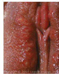
Herpes on the labia