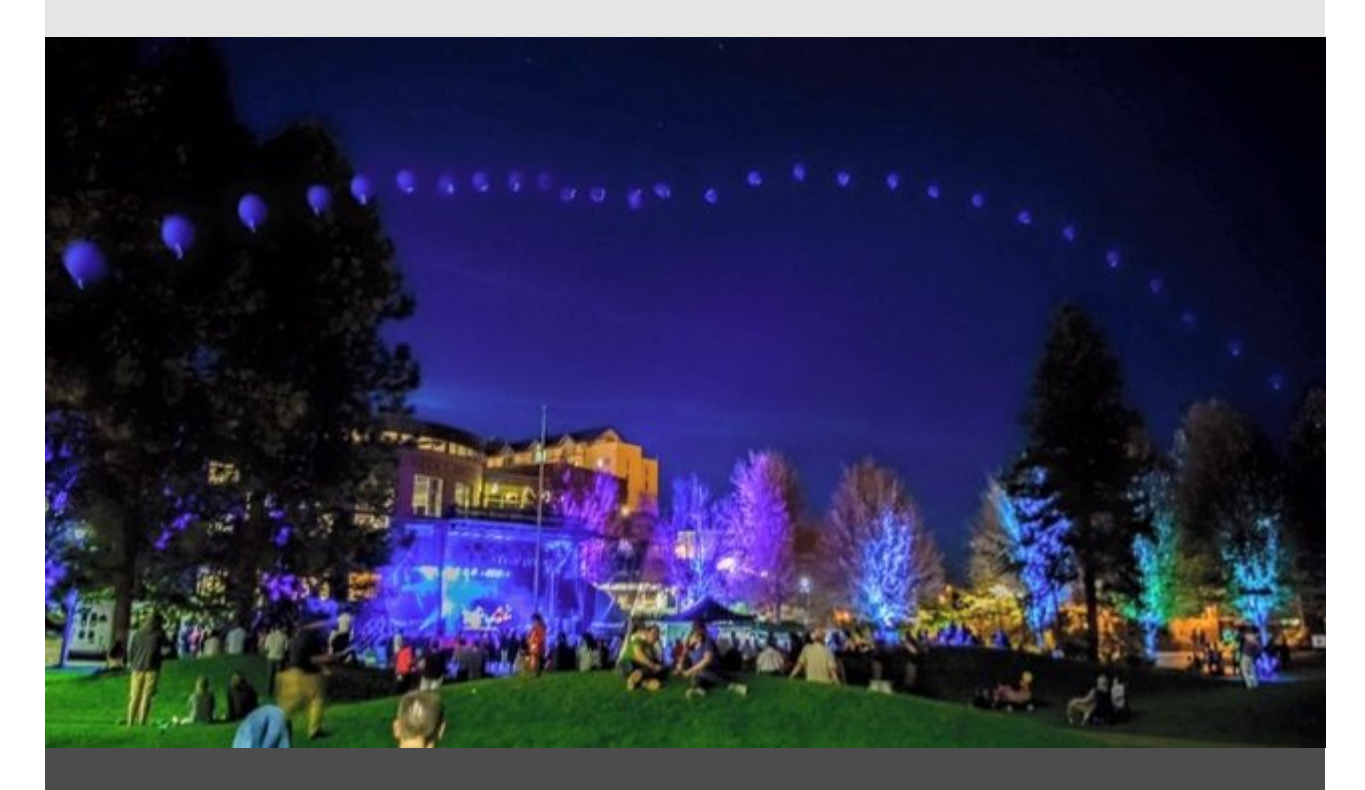
A string of birthday balloons with LED lights arched over the festivities on the Campus Commons as the TRU community celebrated our proud past, promising future at the 45th Anniversary on Sept. 11.

An estimated 1,500 students, faculty, staff, alumni and Kamloops community members celebrated TRU's 45th anniversary with an evening of live music—featuring Van Damsel, Anita Eccleston and Serious Dogs—a food fair and beverage garden, activities and children's play area on the Campus Commons on Sept. 11. On Sept. 12, retirees of Cariboo College, UCC and TRU reminisced and reconnected at a Retirees Breakfast.