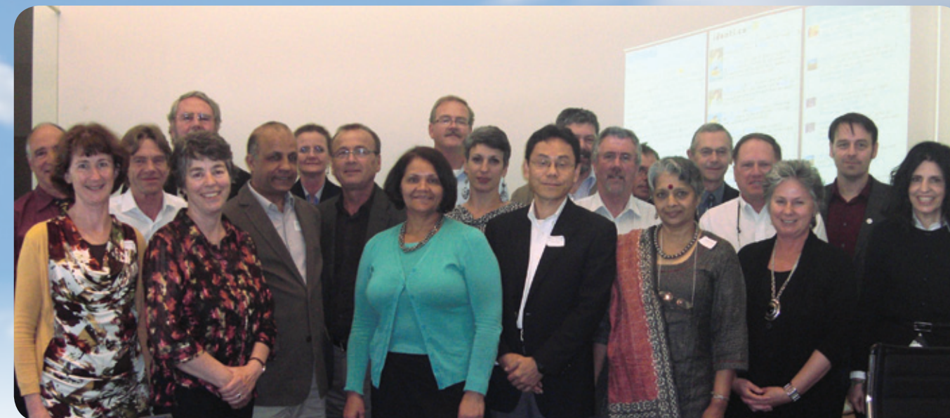
OERu Founding Anchor Partners: Representatives of the OERu founding anchor partners of the OER Tertiary Education Network (OERTen), met from November 9-10, 2011, at Otago Polytechnic in Dunedin, New Zealand for the OERu Inaugural Planning Meeting, hosted by the OER Foundation.

Thompson Rivers University (TRU) and 14 other anchor partners (See Sidebar 1) have formed the Open Educational Resource University (OERu) project to address this exact issue. According to WikiEducator ( http://wikieducator.org/OER_university/Home ), OERu aims to provide "learning to all students worldwide using OER learning materials with pathways to gain credible qualifications from recognized education institutions."