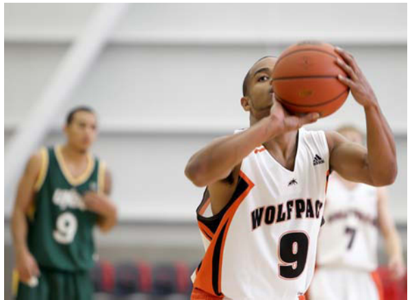
TRU WolfPack in Action